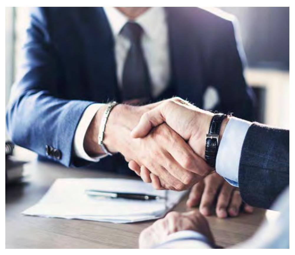
Approved By Investigation Committee June 2022

OIQ, "Would you be able to recognize a conflict of interest?" from PLAN, March 2011, page 42.